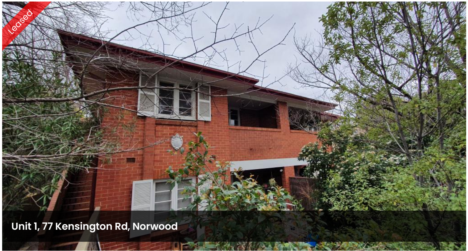
Unit 1, 77 Kensington Rd, Norwood