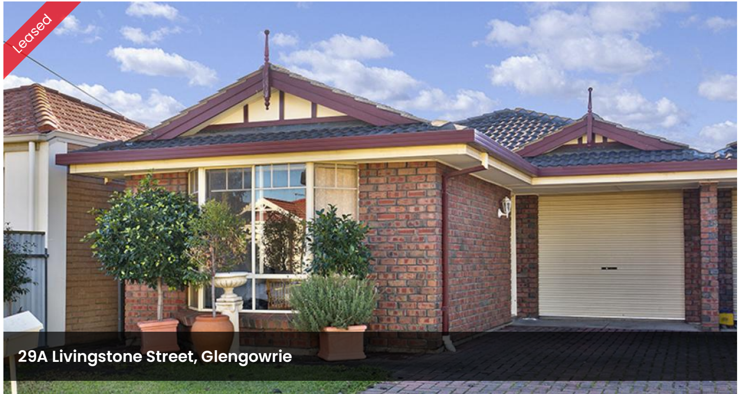
29A Livingstone Street, Glengowrie