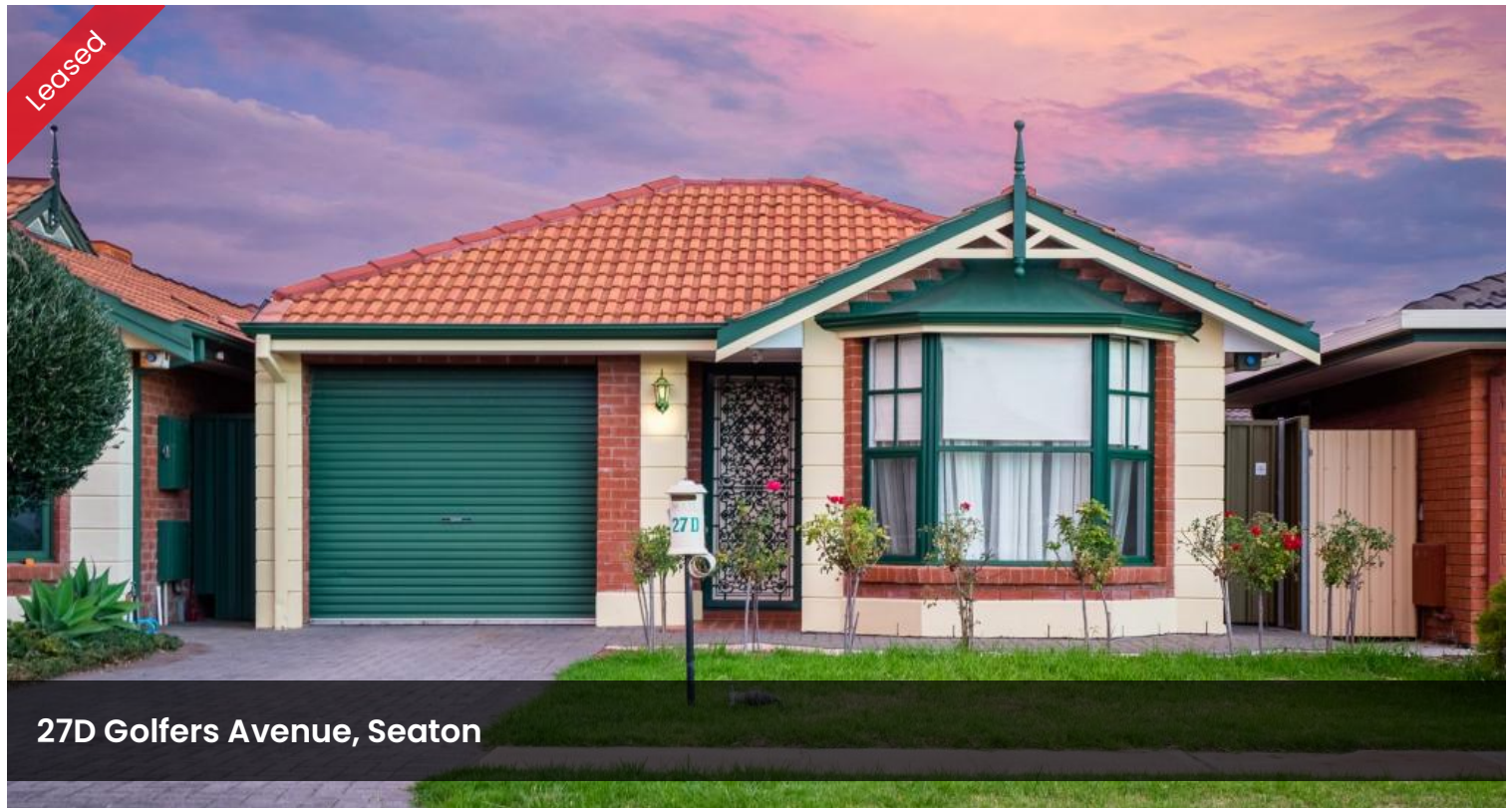
27D Golfers Avenue, Seaton