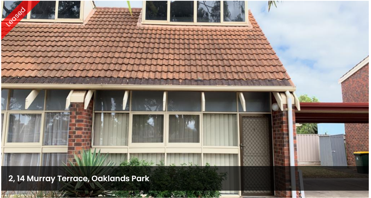
2, 14 Murray Terrace, Oaklands Park