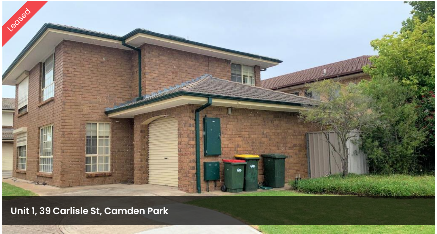
Unit 1, 39 Carlisle St, Camden Park