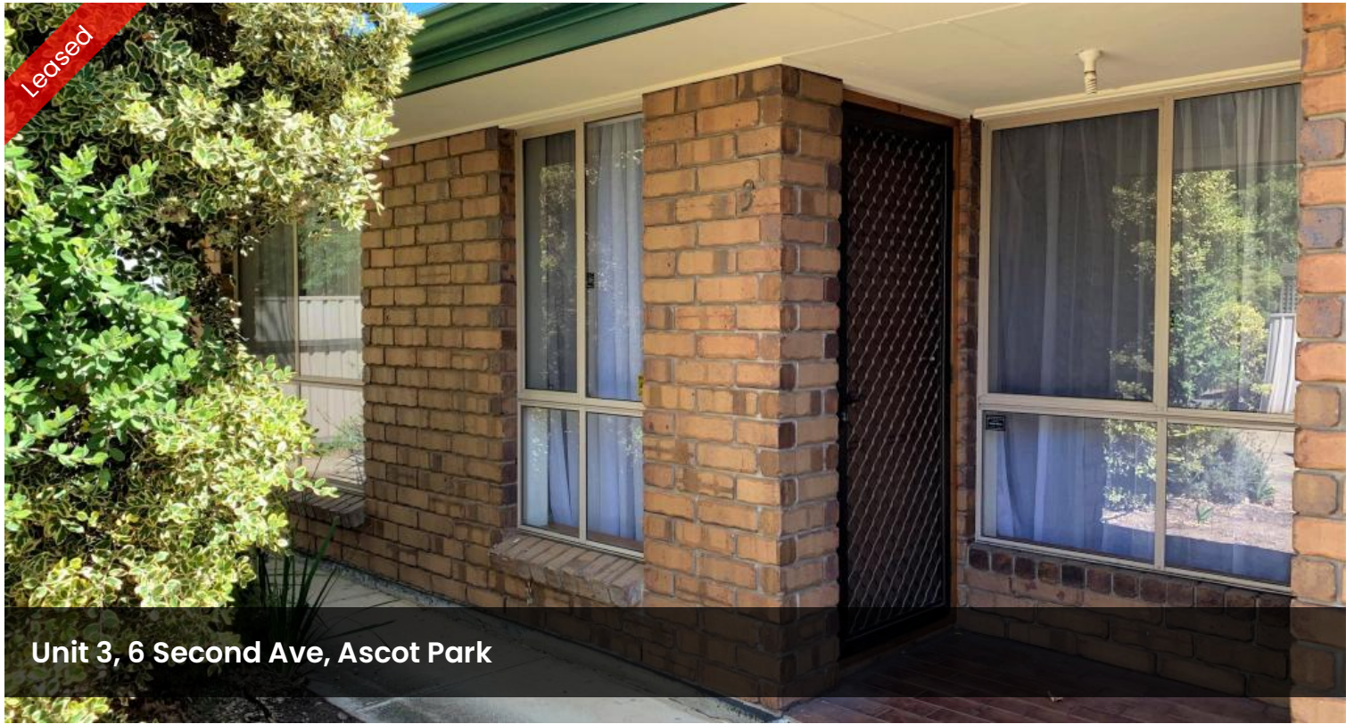
Unit 3, 6 Second Ave, Ascot Park