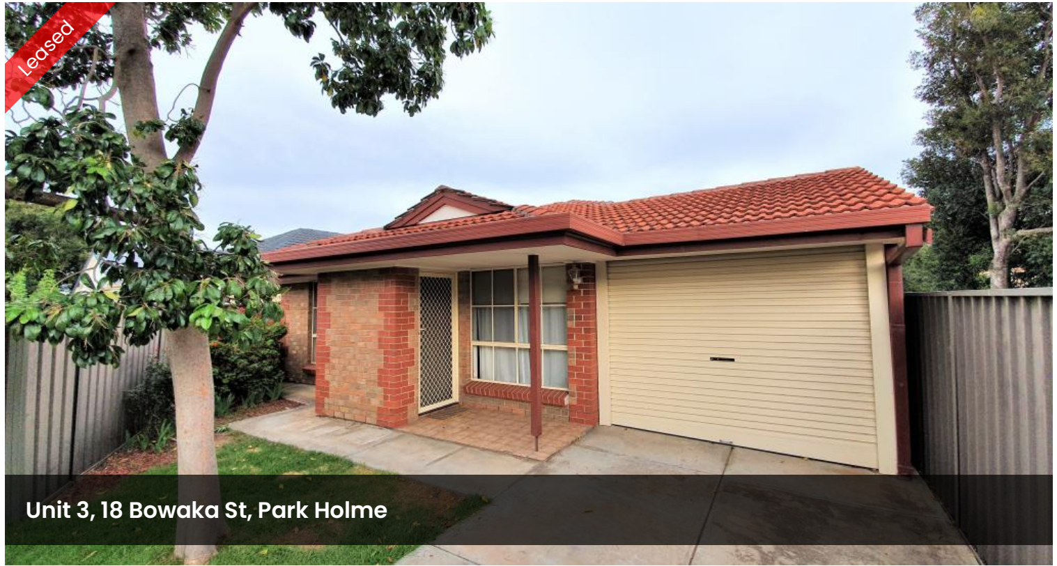
Unit 3, 18 Bowaka St, Park Holme