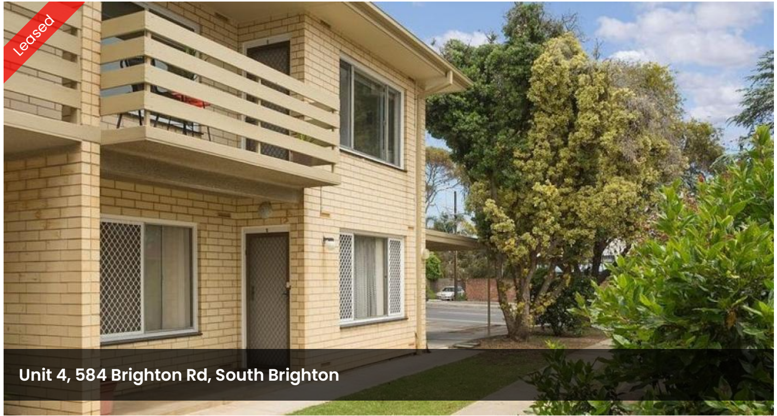
Unit 4, 584 Brighton Rd, South Brighton