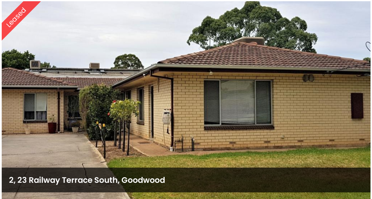
2, 23 Railway Terrace South, Goodwood