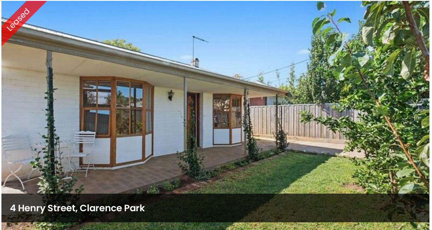
4 Henry Street, Clarence Park