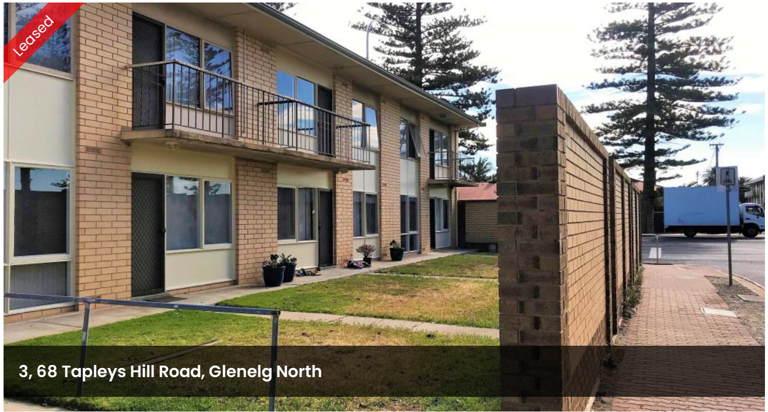
3, 68 Tapleys Hill Road, Glenelg North