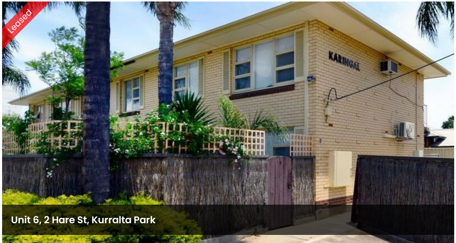
Unit 6, 2 Hare St, Kurralta Park